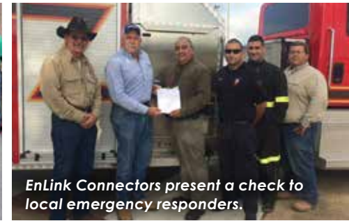
EnLink Connectors present a check to local emergency responders.

Our community investment program embodies our commitment to give back and focuses on these criteria: Community Development, Education, and Health and Human Services.