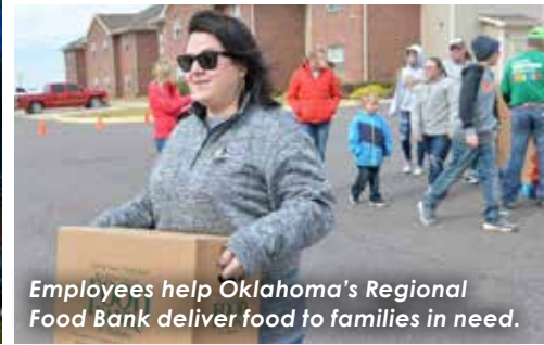
Employees help Oklahoma's Regional Food Bank deliver food to families in need.