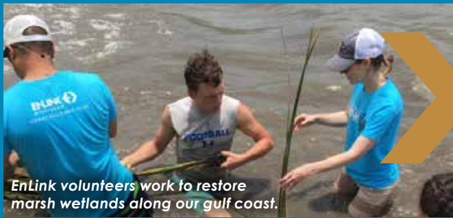
EnLink volunteers work to restore marsh wetlands along our gulf coast.