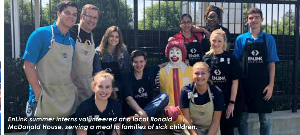
EnLink summer interns volunteered at a local Ronald McDonald House, serving a meal to families of sick children.