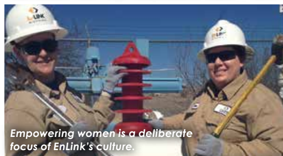
Empowering women is a deliberate focus of EnLink's culture.