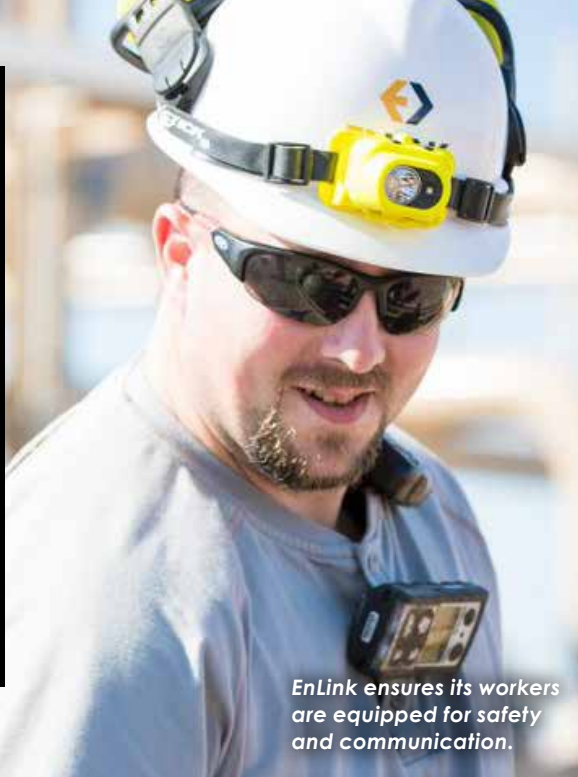
EnLink ensures its workers are equipped for safety and communication.

ENLINK RESPECTS THE HEALTH, HERITAGE, AND CONTRIBUTIONS OF ALL OUR EMPLOYEES, PROVIDING OPPORTUNITIES FOR DEVELOPMENT TO EVERY PERSON.