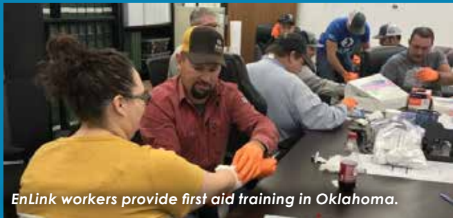
EnLink workers provide first aid training in Oklahoma.