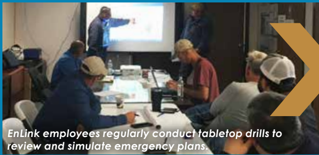
EnLink employees regularly conduct tabletop drills to review and simulate emergency plans.