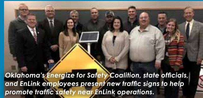
Oklahoma's Energize for Safety Coalition, state officials, and EnLink employees present new traffic signs to help promote traffic safety near EnLink operations.