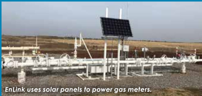
EnLink uses solar panels to power gas meters.