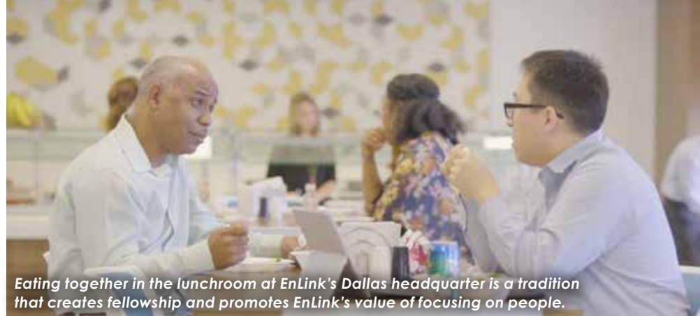
Eating together in the lunchroom at EnLink's Dallas headquarter is a tradition that creates fellowship and promotes EnLink's value of focusing on people.