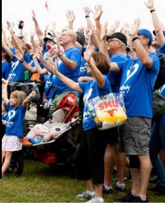
Approximately 500 people signed up for EnLink's team at the American Heart Association Dallas Heart Walk.

ENLINK MIDSTREAM ENTHUSIASTICALLY CONTRIBUTES TO THE GROWTH AND SUCCESS OF THE COMMUNITIES WHERE WE LIVE AND WORK.