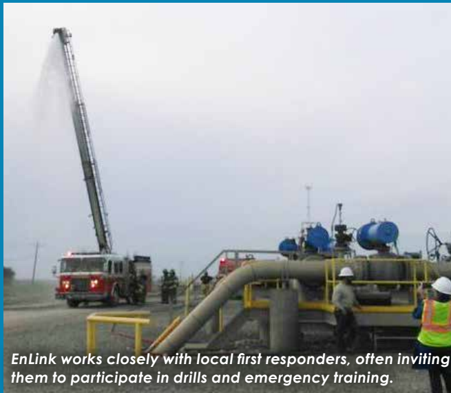
EnLink works closely with local first responders, often inviting them to participate in drills and emergency training.