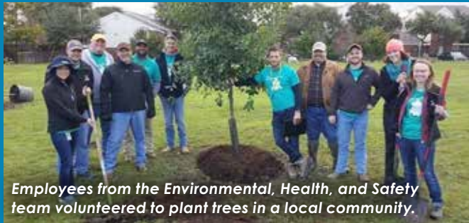
Employees from the Environmental, Health, and Safety team volunteered to plant trees in a local community.