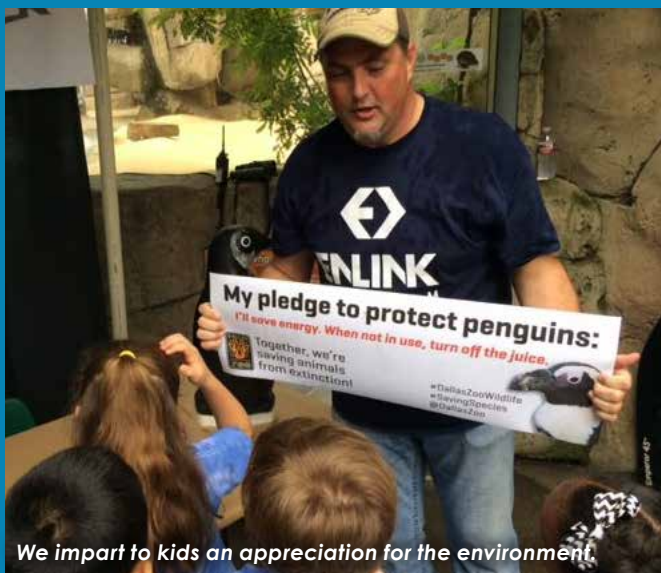
We impart to kids an appreciation for the environment.