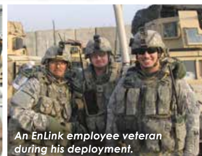
An EnLink employee veteran during his deployment.

EnLink encourages employees and their spouses to get an annual wellness checkup, which resulted in over three-fourths of employees getting a checkup in 2018.